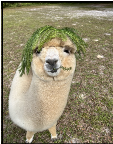
Stormin' Norman Casadellama

So keep enjoying your critters, keeping them healthy and safe. Hopefully we will see you all this next year.